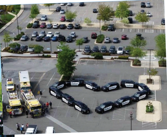
Local first responders showed their heartfelt appreciation for CHMC during Hospital and Nurses Week.